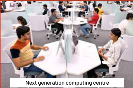
Next generation computing centre