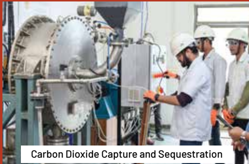
Carbon Dioxide Capture and Sequestration