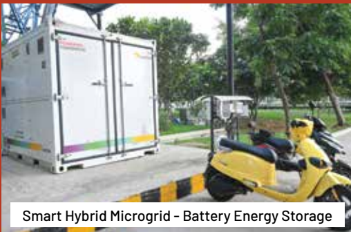
Smart Hybrid Microgrid - Battery Energy Storage