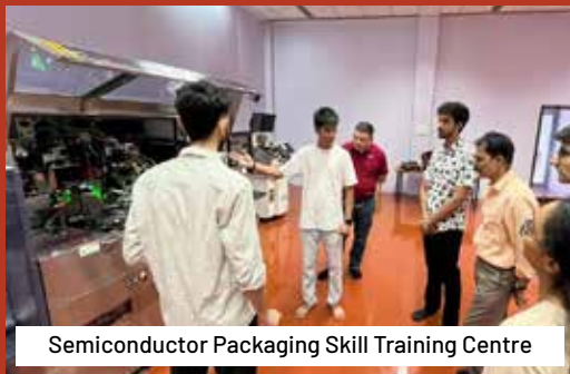
Semiconductor Packaging Skill Training Centre