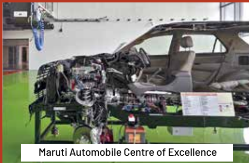
Maruti Automobile Centre of Excellence