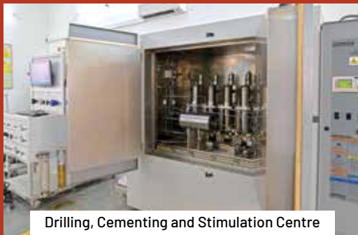
Drilling, Cementing and Stimulation Centre