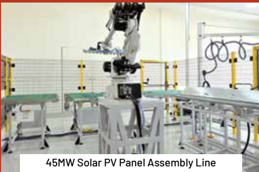
45MW Solar PV Panel Assembly Line