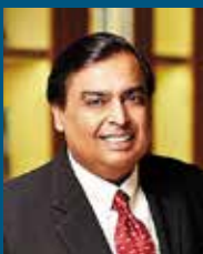
Dr. Mukesh Ambani Founder President & Chairman BoG